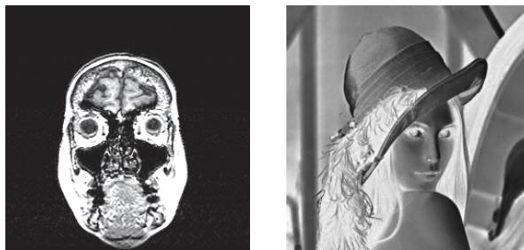
Fig.2. Two dissimilar images.