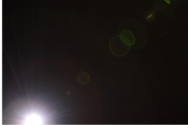
Fig. 3. Demonstration of inner lens reflection artifacts acquired by camera