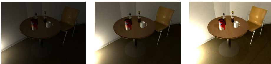
Fig. 2. Same image with different exposure

Exposure influences the amount of light allowed into the optical system during the acquisition process of a single video frame. Therefore the exposure affects brightness of the frame. It is an important task of a camera to control the brightness because the image brightness affects how much information can be obtained from the image/video. The adaptation is usually not instantaneous and reaching optimal exposure can take some time.