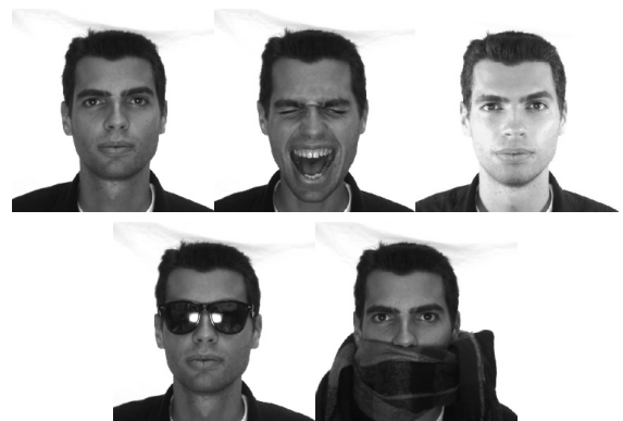
Figure 2. Some examples of images in the AR database

In order to facilitate the research in this field, many benchmark databases have been created to quantify the performances of a proposed algorithm and compare with the state of the art. The AR face database [10] is one of the most interesting one because it is composed of a large amount of individuals (120) and samples (26 per individual). Figure 2 shows 5 images of the same individual.