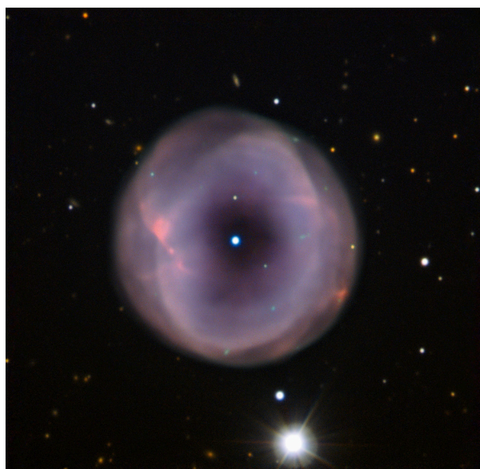
Colour-composite image of the large planetary nebula IC 5148 taken with EFOSC2 on the New Technology Telescope at La Silla (image size 4.2 by 4.2 arcminutes) formed from exposures in B , H \beta , V , R and H \alpha filters. The nebula morphology consists of two distinct shells but the bright ansae indicate more complex substructure. The emission nebula is of high ionisation and the very hot central star is obvious. See Picture of the Week 15 October 2012 for more information.