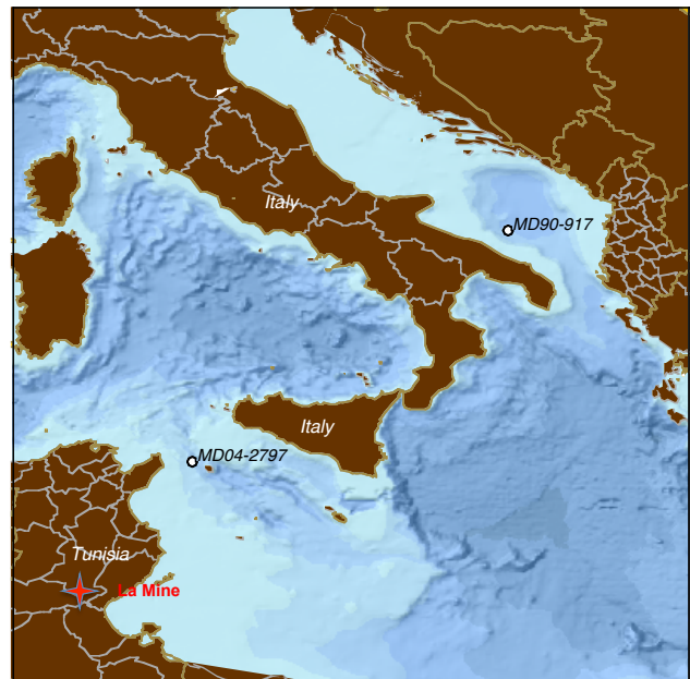
Fig. 1. Map showing the location of the two study cores of the Central Mediterranean Sea: MD90-917 (South Adriatic Sea) and MD04-2797 (Siculo–Tunisian Strait). The red star indicates the location where the La Mine stalagmite has been collecting.

The age model of the MD04-2797 core is based on 12 AMS ^{14}\text{C} dates (Table 1) performed on planktonic foraminifera in the size fraction > 150\ \mu\text{m} by the mass accelerator (AMS) ARTEMIS located in Gif-sur-Yvette, France. The ^{14}\text{C} ages were converted into calendar age using INTCAL09 (Reimer