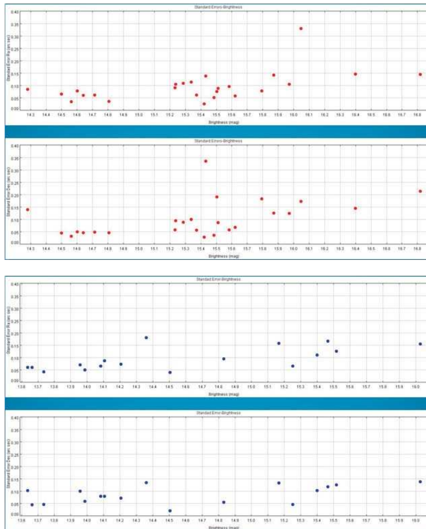
Fig. 4: Standard errors for Ra and Dec

Figure 4 shows the standard errors obtained in this study in Ra. and Dec. with respect to the magnitude for Lemaitre and Gaby asteroids. As can be seen, most of the errors are less than 0.15 arc sec in both coordinates.