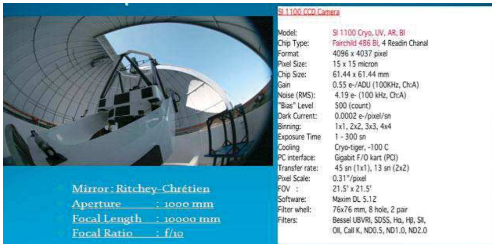
Fig. 1: T-100 Telescope Technical Specifications

All of the observations of Lemaître and Gaby were obtained by using the remote control T-100 telescope which has 1 meter R-C type mirror with 10 meters focal distance, 0.3 arc sec pixel scale and 22 arc minutes field of view (see ref.1). T100 telescope located in TUG (TUBITAK National Observatory) Bakirlitepe Mountain (2500 meters high above the sea level) close to Antalya, which has 260 clear nights in a year and 0.8 arc sec median seeing (Fig.1).