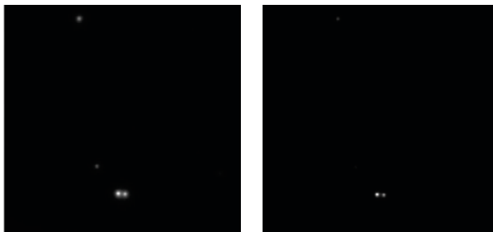
Fig. 3: Improvement of imaging by the lucky image technique: the binary Cepheid CE Cas ( left : without lucky imaging; right : with lucky imaging)

We initiated a photometric search for close visual companions of Cepheids by lucky imaging technique with an EMCCD camera at the 50 cm Cassegrain telescope. Figure 3 visualizes the improvement in the angular resolution using this technique, via the example of CE Cas, a double Cepheid, whose both components are Cepheid variables with a 2.3" separation.