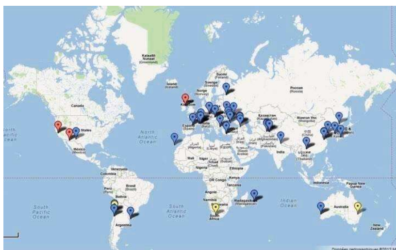
Fig. 1: Localization of the observing sites registered (in blue) in the Gaia-FUN-SSO network

The network has been developed on the basis of contacts with observers who are using instrumentation adapted to astrometric measurement on alert. The alerts must be triggered almost 48h after the detection. The minimum requirements are the following: to access the instrument in the nights following the alert; to perform short observing runs with CCD camera, pixel size of less than 1 arcsec; to use a field of view not too small (greater than 10 arcsec is useful in order to get reference stars); and to reach a limiting magnitude down to 20 similar to the Gaia limiting magnitude.