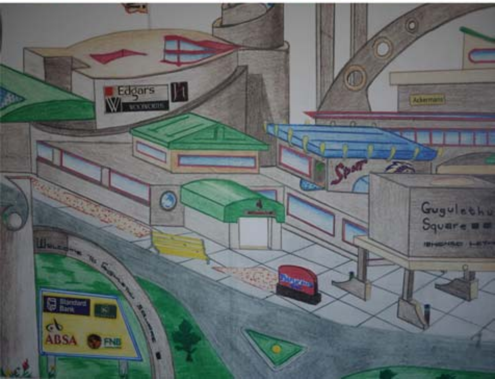
Figure 6. Two visions of Gugulethu. November 2010.

famous vibrant township social life is also lacking here. As such, Gugulethu Square presents shortcomings like, but less blatantly than, other newly built township malls (Le Gorre 2010). An example is the Khayelitsha mall, which opened in 2005 and spreads discount stores over an exposed, wind-swept, sandy area. Although Gugulethu Square has