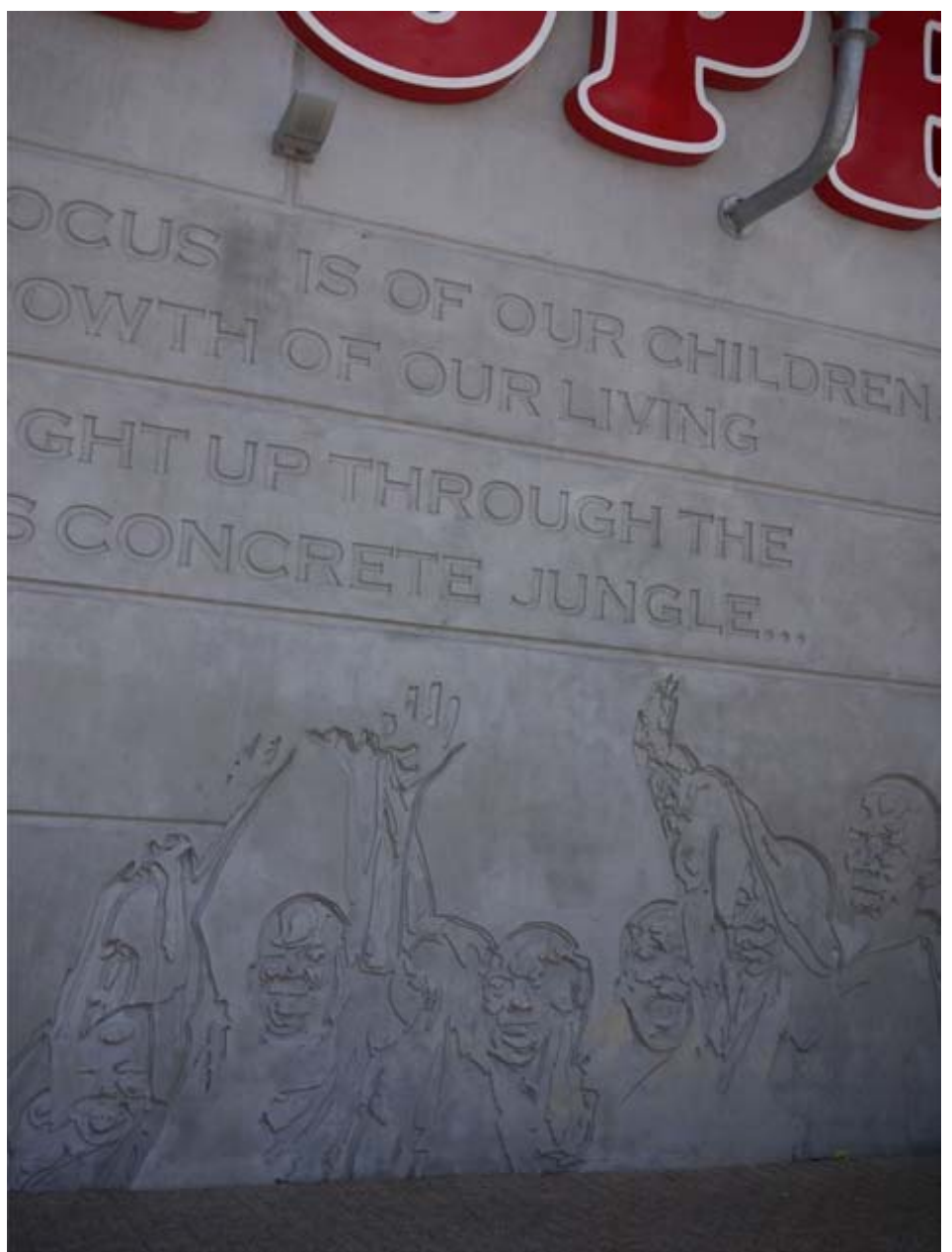
Figure 4. Under the Shoprite logo, poetry and sculpture celebrating African pride and future. November 2010.

unifying theme of this mall is the pride in the 1994 negotiated revolution – a nation's pride, and the pride of the people who live in Gugulethu. Pride is a political term here; it is not hard to read beyond the local toponymy and recognize a reference to black Africanist pride and to former president Thabo Mbeki's notion of an African renaissance. Or, as the architects claim: