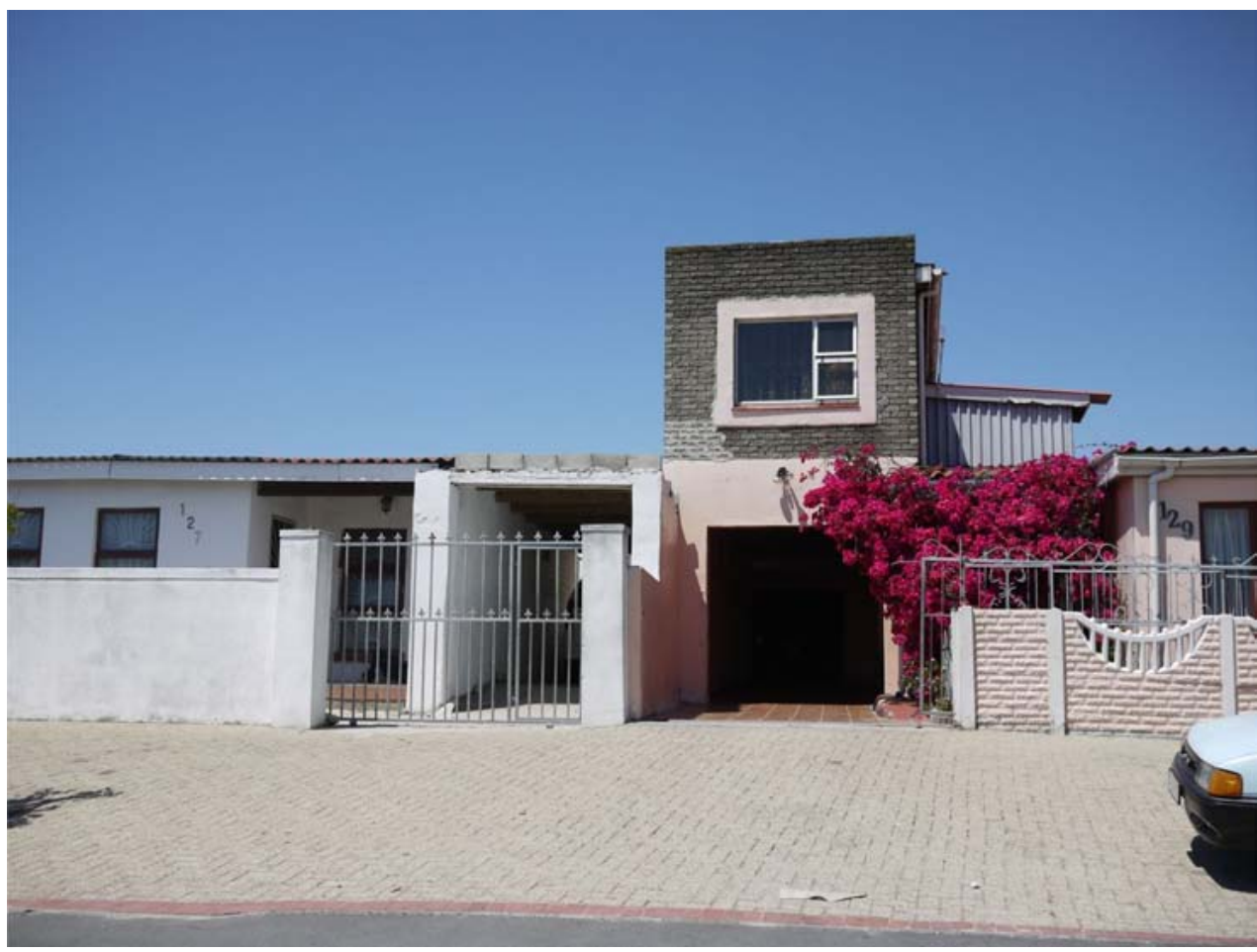
Figure 1. Many of the original matchbox houses have been fenced. Extensions, garages, gardens, verandas and, more rarely, additional levels reflect both better material conditions and a sense of belonging to the place. November 2010.

people from all over Cape Town and beyond; interesting new artists such as the group known as the Gugulective, who hold exhibitions in a local shebeen; and a local high school, ID Mkhize, succeeding in increasing its matriculation pass rate to 80%. All this is rather anecdotal evidence but points, despite the tensions, to Gugulethu's positive characteristics. At the metropolitan level, it is slowly becoming known as a place of leisure, tourism and artistic expression.