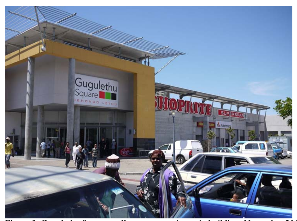
Figure 3. Gugulethu Square mall, entrance to the main building. November 2010.

In 1998, four years after the end of apartheid, the SBDC changed its name to Business Partners Limited. The name change was aimed at distancing the company from the past's racial divisions, at marking a new beginning, as well as at demonstrating that it embraced its new neoliberally inclined business goals.12 In 2005, Business Partners – still largely a white-run company – sold the land on which the Eyona mall stood to Khula Business Premises, a company owned by the Department of Trade and Industry. According to sources, the price paid was R11.70, which was the approximate rand value of one dollar at the time.13 The Eyona Shopping Centre was bulldozed in 2008 to make way for Gugulethu Square. In 2009, the land was sold to the developer West Side Trading, which consisted of Old Mutual, Group 5, and Mzoli Properties (which owned 9% of the shares), while 10% belonged to Khula Enterprise Finance, another state-owned organization.14 Gugulethu Square mall opened its doors in 2009.