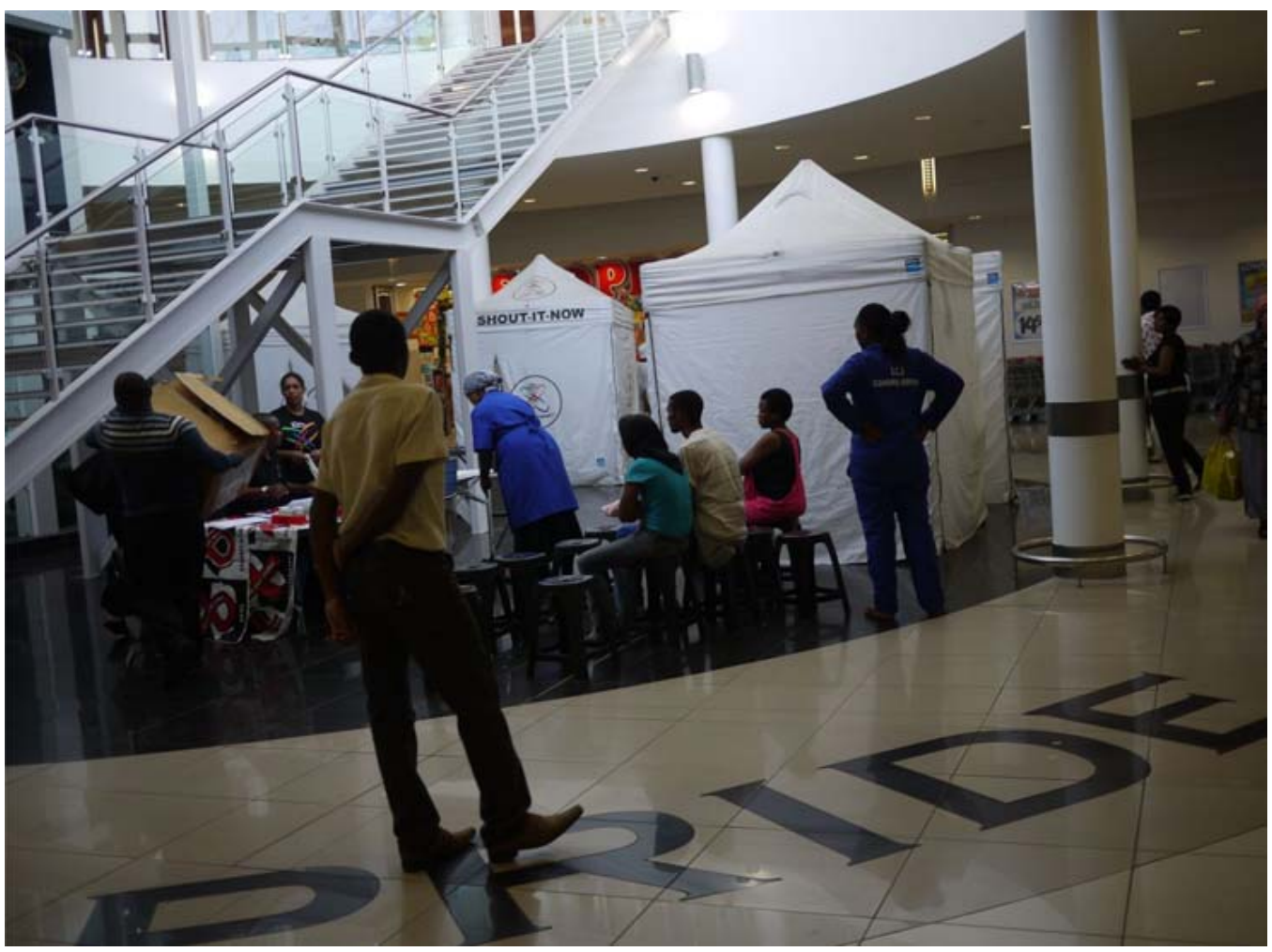
Figure 5. In the centre of the mall, next to Shoprite grocery store, people queue to have their HIV status identified. November 2010.

Despite all this pomp and circumstance, one cannot shake the feeling that there is a discrepancy because some of the main shops usually present in South African malls are absent. There is, for instance, no bookshop; the familiar CNA is missing. The most upmarket retail chains, such as Woolworths or Pick'n Pay, are absent – although they do feature in Mzoli's future, still unconfirmed, plans. Nor is there a proper food court and many of the popular fast-food outlets are missing. Food is sold at, for example, Debonair's pizza, which is mainly a take-away outlet. The famed KFC and a low-quality Hungry Lion are situated at the entrances next to the taxi ranks, turning their greasy backs to the rest of the mall. In the South Mall, there is a Spur, a well-liked South African fast-food chain, but the locals do not seem to frequent it much. Furthermore, a typical mall feature, namely a space for just hanging around, is missing. There are no cafe's, and very few benches. The act of just shopping and loitering around seems to be much less favoured here than in other Cape Town malls (Houssay-Holzschuch and Teppo 2009). In fact, the missing food court and the location of fast-food outlets actively discourages any form of mall sociability. In their stead, there is an abundance of security arrangements,