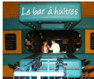
To taste and sell : an oyster bar