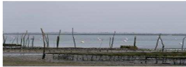
Awareness : the natural environment (pond / marsh)