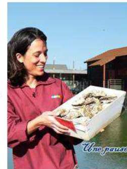
Valorise image and locale identity