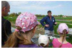
Explain : the oyster farm