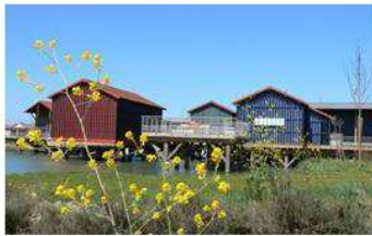
Valorize : the city of oysters