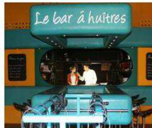
To taste and sell : an oyster bar