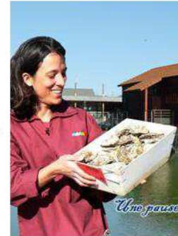
Valorise image and locale identity