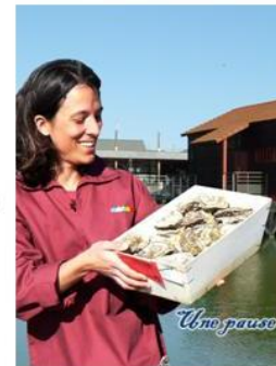
Valorise image and locale identity