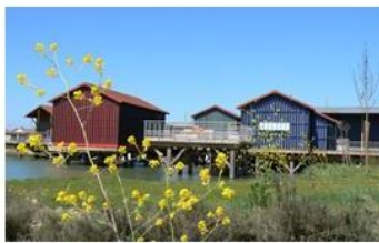
Valorize : the city of oysters