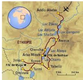
The National Park of Nechisar in South Ethiopia.