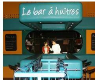
To taste and sell : an oyster bar