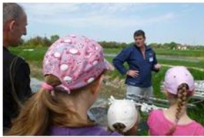
Explain : the oyster farm