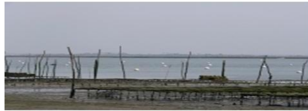
Awareness : the natural environment (pond / marsh)