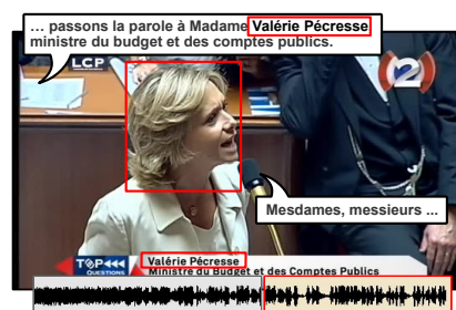
FIGURE 1 – The REPERE corpus. The identity appears in multiple sources.

We propose to directly associate OCR and speech detected names with current faces and speakers, and then propagate that information within and cross modalities with face and speaker similarities and talking face detection. This paper is organized as follows : Section 2 describes related work ; Section 5 describes person name acquisition from OCR and ASR output ; Section 6 similarity measures for speaker and face clustering ; Section 7 presents our identity propagation method based on direct and indirect association. Finally, Section 8 presents the REPERE corpus, results of experiments and a discussion.