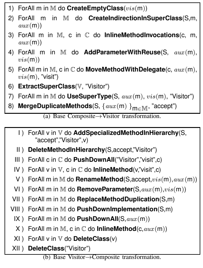
Figure 3. Base Algorithms for reversible transformation from Composite to Visitor.

We use the following notations to abstract the algorithm from the given example: