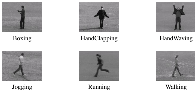
Fig. 1: Example of videos from KTH