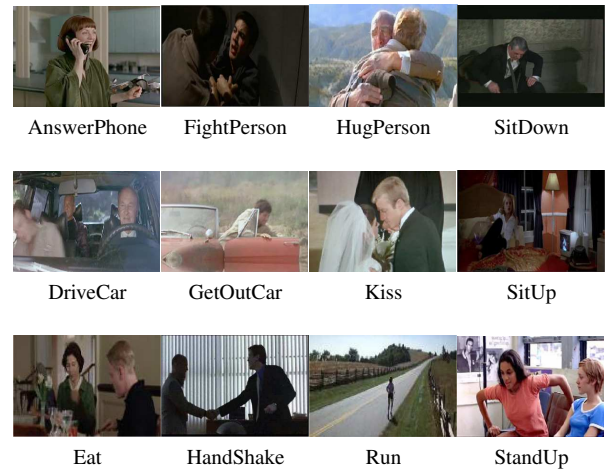
Fig. 2: Example of videos from Hollywood2 dataset

The Hollywood2 [2] dataset consists of a collection of video clips and extracts from 69 films in 12 classes of human actions (Figure 2). It accounts for approximately 20 hours of video and contains about 150 video samples per actions. It contains a variety of spatial scales, zoom camera, deleted scenes and compression artifact which allows a more realistic assessment of human actions classification methods. We use the official train and test splits for the evaluation.