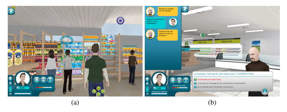
Fig. 2 (a) In FORMAT-STORE, the player controls an avatar in the virtual store using the keyboard arrows and interacts with the items and the customers using the mouse. (b) Dialogues in the game describe problematised situations and are rendered by means of a specific interface.