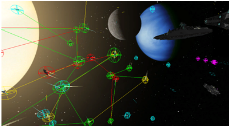
Fig. 2. A view of the Galaxian simulation. The colored circles surrounding the agents represent the interaction they are currently performing and the line ends on the corresponding target agents (the agent that is undergoing this interaction).