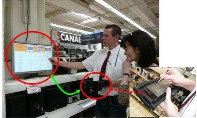
Figure 1. In store: extended interaction with assistant and screen.

A first prototype has been deployed for one month within the “nomad” department store (cameras, GPS...) of a local hypermarket, involving 4 sellers. The target products were high-end numeric cameras and GPS devices. Figure 1 shows a typical use of the prototype in store where the seller will select some products based on his discussion with the client. Then, he can share product comparison on an external screen for discussion with the client. The product features can be used as entry points towards resources either on the mobile device for the seller or on the shared screen to