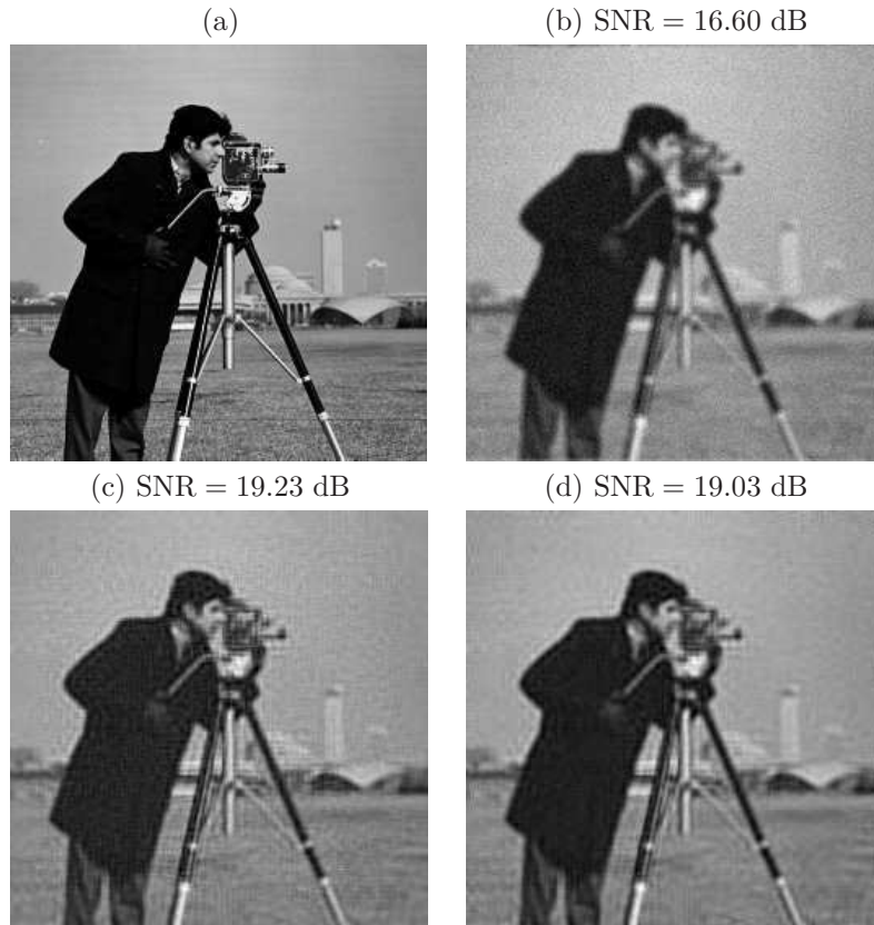
Figure 1. Original image (a), degraded one (b) and restored images using AA (c) and SA (d).

Figure 1 shows the reference cameraman image (a), the degraded one (b) and restored ones using AA (c) and SA (d). We notice that visually, the two restored images are quite similar. In terms of SNR, AA gives slightly better restored images with 0.2 dB of SNR improvement over SA.