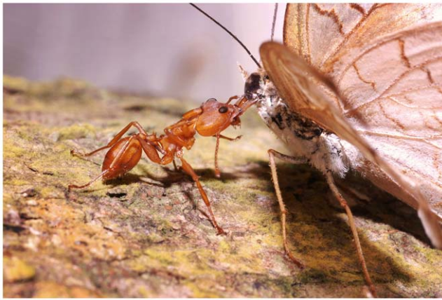
Figure 3. An ambushing Daceton armigerum worker that just seized a pierid butterfly after striking it on the head with its long mandibles. This numbed the butterfly at first, but it later struggled and was then spread-eagled by six recruited workers. One can note the well-developed claws on the pretarsa, at the extremities of the worker's legs, permitting it to get a good grip on the bark of the host tree. doi:10.1371/journal.pone.0037683.g003

polygynic (multiple queens) and polydomous (multiple nests), can reach to ca. 952,000 individuals (so, even much more than the 10,000 workers suggested by Wilson [2]). We can compare them to those of the well studied arboreal weaver ant Oecophylla estimated at ca. 500,000 workers [24]. Furthermore, only D. armigerum workers shelter in the small chambers situated at the end of branches on host trees which is reminiscent of the “barracks” leaf nests built by Oecophylla beyond the limits of their territories and containing only old workers [24].