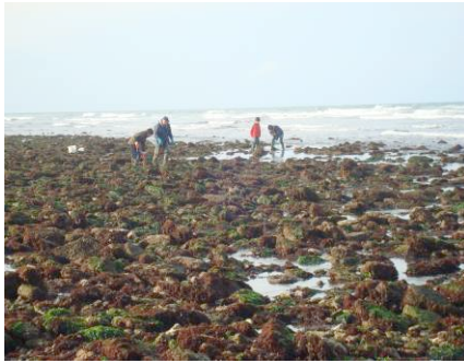
Figure 1: Boulder fields of the rocky foreshore of Saint-Denis d'Oléron