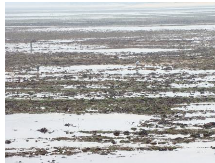
Figure 2: Rocky outcrops of the La Brée-les-Bains foreshore