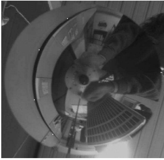
Figure 2. A catadioptric image, with four points used for the line localization