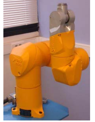
Fig. 1. Link frames of the TX-40 robot