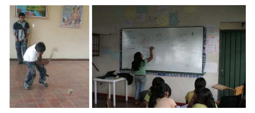
Fig. 2. Nasa kid playing with a spinning top during a competition in the Tumbichucue (left). Collective evaluation of the design of the spinning top game in Caldono (right).