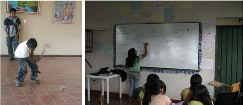
Fig. 2. Nasa kid playing with a spinning top during a competition in the Tumbichucue (left). Collective evaluation of the design of the spinning top game in Caldono (right).