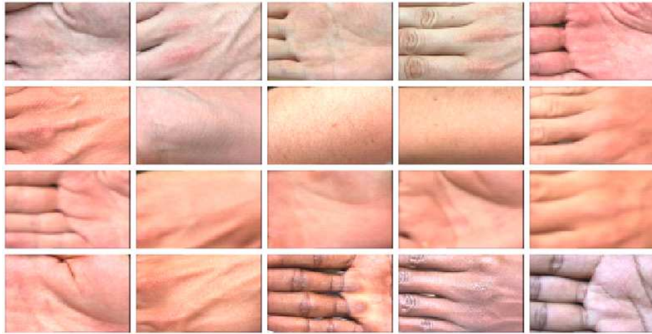
Fig. 3. A representation of different human skin color variations

stores the measures of bounding boxes distance and provides tracks instead of just blobs.