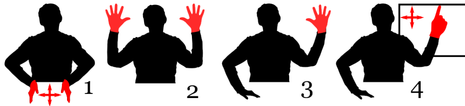
Fig. 1. Family of supported gestures represented using the free gestures icons library from [1]

In order to identify relevant gestures we have analyzed some talk-shows, and we have extracted the most frequent gestures being performed. According to our scenario of use in the context of interactive TV (RevTV project), we need some gesture to trigger commands, as well as other gestures to implement natural interaction with the avatar. We have created a vector based gestures icons to represent them. These 4 icons, represented in figure 1, are part of the ishara library [1]. They represent the gestures supported by the software of our application. We provide a movement mode, a multitouch mode, a command mode, a hand fingers recognition, and, finally, a cursor movement mode (see Section 5 for detailed explanation of these modes).