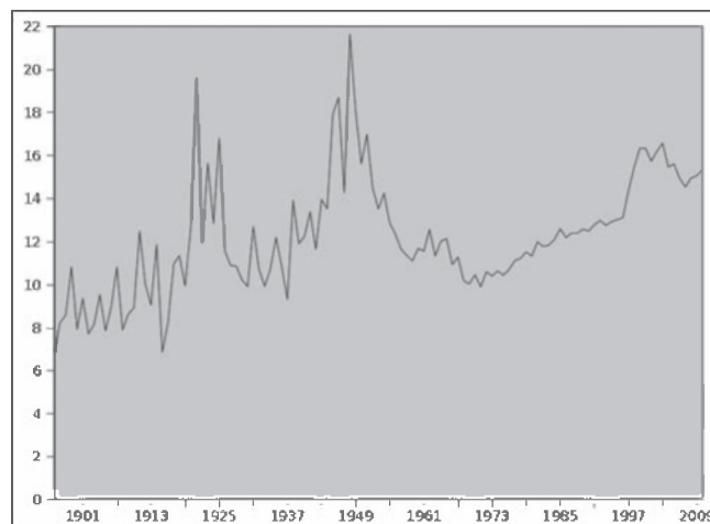
Average reference time lag per year in zbMATH data.

Another question pertains to the small but visible differences in time lag for EuDML and zbMATH data for recent decades, where both services have a comparable magnitude of data and one would expect convergence. The higher time lag (by about 1.5 years over the last two decades) in EuDML seems to be influenced by two effects: firstly, zbMATH identifies more recent references which appear initially without a publication year and,