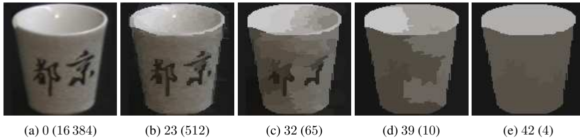
Figure 3: Some levels of the partitioning of ‘Obj18_355’: level (number of components).