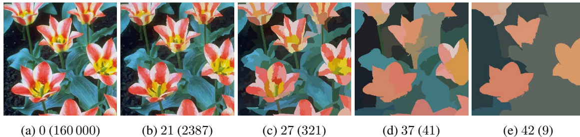
Figure 2: Some levels of the partitioning of ‘Tulips’: level (number of components).

the attributes of u_i . Using gray level images, d and F may be respectively defined as the distances deduced from the L_1 norm from the gray level intensity of pixels. Using color images, one may think to valuate each edge by the Euclidean distance between the vertice’s colors using a perceptual color space such as the CIE Luv or Lab. However, the use of CIE color spaces requires the knowledge of the illuminants defining RGB components which is often not available. Therefore, for the sake of simplicity and in order to valuate our method we choose in our experiments a simple Euclidean distance in RGB space. However the choice of the definition of the weights and the features to be used is in general a hard problem, since the grouping cues could conflict each other [13].