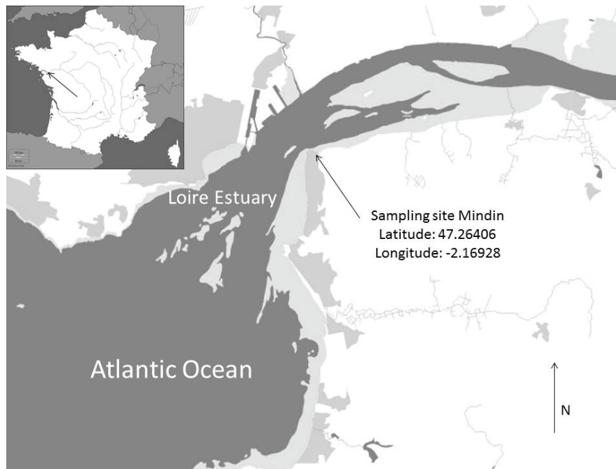
Fig. (1). Location of the sampling site of Hediste diversicolor in the Loire estuary, France.

was added to the overlying water of each core. After 10 days of incubation, the overlying seawater was removed by siphoning. The sediment was sectioned vertically into 0.5 cm-thick layers from the surface down to 2 cm depth, and then into 1 cm-thick layers down to 15 cm for Hediste cores (only down to 5 cm for the control core). Each sediment layer was freeze-dried and then homogenized. We used a gallery-diffusers model [13] with the pseudo-diffusive mixing (Db) in the region of intense burrowing activity (surface) and non-local transport (r) from the upper layers down to the tube bottom.