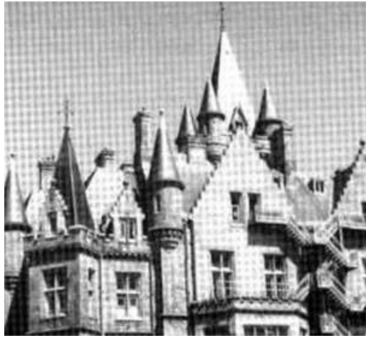
(a) Original grayscale image with texture noise.