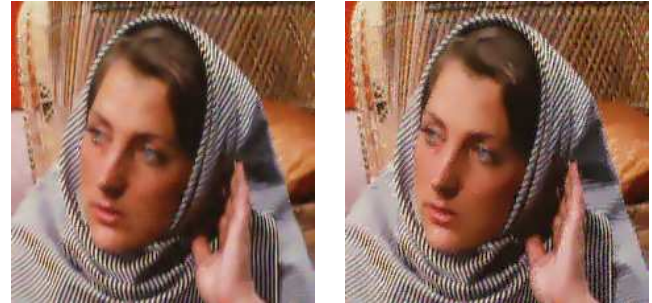
(d) Non-Local Means [5]. (e) Patch-based anisotropic diffusion (Our proposed method Eq.(4)).