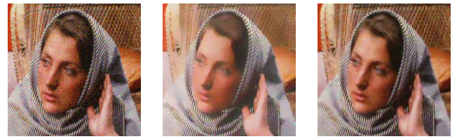
(a) Color image + noise. (b) Bilateral filtering[19]. (c) Anisotropic PDE[20].