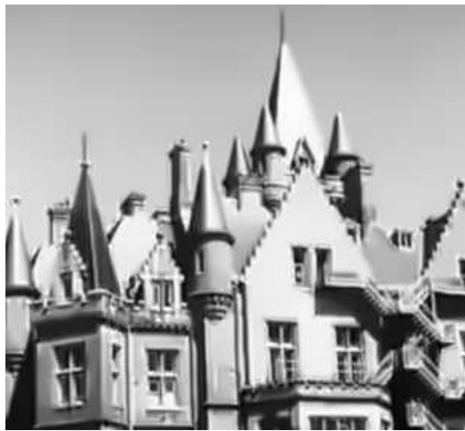
(b) Denoised version using our non-local anisotropic diffusion Eq.(4).