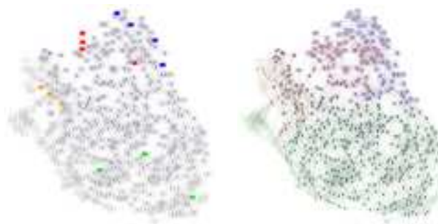
Fig. 3. Illustration of nuclei classification using, semi-supervised graph clustering and our label-propagation algorithm. Left: seeds of each class. Right: classification result.

The last step of both methods, which comes after nuclei segmentation and features computation processes, is to determine if some of the extracted nuclei are abnormal. Such problem can be seen as a data classification one, in two (or more) classes: the data to classify is the set of nuclei (represented by their feature vectors) and typical classes are normal and abnormal . Finally, the classification problem can be seen as a semi-supervised graph clustering problem, where the data is represented as a k -nearest-neighbor graph (each feature vector is represented by a vertex which is connected to its k most similar vertices in the whole graph, according to a similarity function). The clustering is performed using our label-propagation algorithm on graphs, with a label per class. Labels seeds are given by a reference data-set (where the class of each nucleus is known) the entries of which are added to the graph. Such a clustering method is presented as a complement of the two nuclei extraction methodologies presented above, and illustrated on Fig. 3 with a 4-labels semi-supervised graph clustering example. Using graph-based label propagation for clustering the set of nucleus has two main advantages. First there is no classifier training, and modifying the reference data-set does not imply to re-train a classifier (as it is the case while using neural networks for exam-