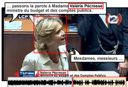
FIGURE 1. The REPERE corpus. The identity appears in multiple sources.

We propose to directly associate OCR and speech detected names with current faces and speakers, and then propagate that information within and cross modalities with face and speaker similarities and talking face detection. This paper is organized as follows: Section 2 describes related work; Section 3 describes person name acquisition from OCR and ASR output; Section 4 similarity measures for speaker and face clustering; Section 5 presents our identity propagation method based on direct and indirect association. Finally, Section 6 presents the REPERE corpus, results of experiments and a discussion.