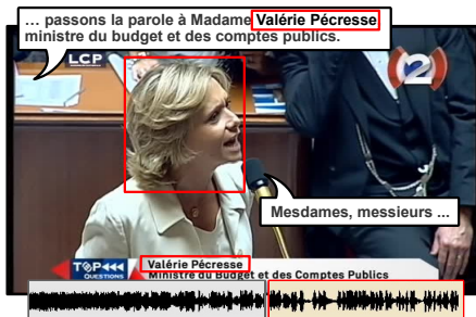
FIGURE 1. The REPERE corpus. The identity appears in multiple sources.

We propose to directly associate OCR and speech detected names with current faces and speakers, and then propagate that information within and cross modalities with face and speaker similarities and talking face detection. This paper is organized as follows: Section 2 describes related work; Section 3 describes person name acquisition from OCR and ASR output; Section 4 similarity measures for speaker and face clustering; Section 5 presents our identity propagation method based on direct and indirect association. Finally, Section 6 presents the REPERE corpus, results of experiments and a discussion.