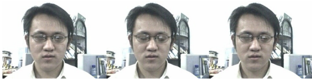
Figure 3. JZU database sample for closed eye (Video: 000001M_FBN.avi, Frames: 35, 39 and 42) All frames between the 35 th and 42 nd frames are labeled as closed eye frame since both eyes are at least 80% closed.

In literature, the PERCLOS (PERcentage of eye CLOSure) [11] value has been used as drowsiness metric which shows the percentage of time in a minute that the eyes are 80% closed. In addition, we manually marked the frames that eyes are at least 80% closed as seen in Figure 3.