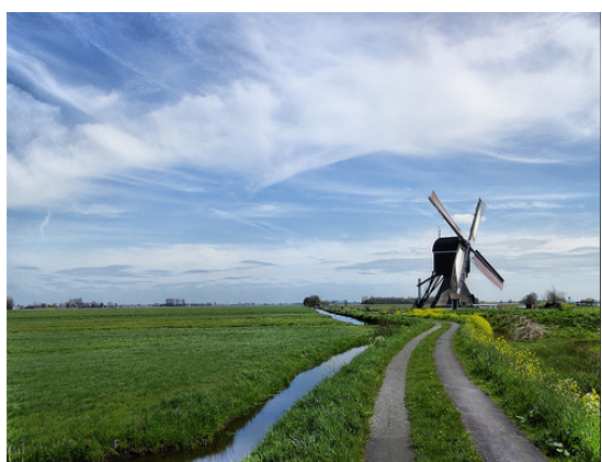
Figure 2: Study area Alblasserwaard