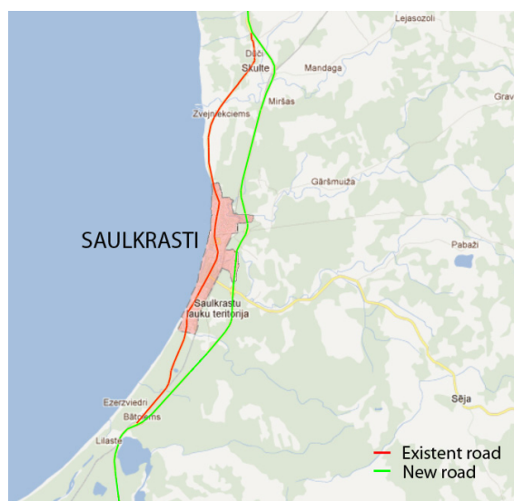
Figure 1: The location of the existent and new-build roads

Accordingly to EIA report [5] the research project under consideration is a span of the road VIA Baltica , which links Helsinki and Warsaw through Baltic States and is a part of one of the nine priority European multimodal transport corridors. The span is located in Latvia between the settlements of Lilaste and Skulte. It relieves other surrounding roads from goods transportation vehicles and serves as a bypass around the seashore resort Saulkrasti. The location of the existent and new-build roads can be seen in Figure 1.