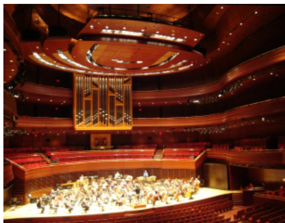
Figure 4: Verizon Hall after modifications.