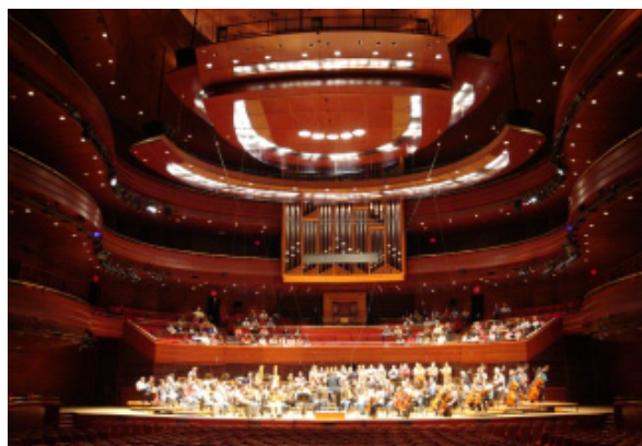
Figure 3: Verizon Hall before modifications.

During the initial acoustic assessment, heights of the stage canopy were evaluated. It was found that the canopy could not be adjusted significantly from its lowest setting without loss of stage communication. However, the low setting preferred by performers created problematic reflection conditions due to a series of vertical sound reflecting panels originally installed at the underside of the three canopy rings. Removal of these vertical panels was evaluated during the initial assessment, and they have not been reinstalled at this time.