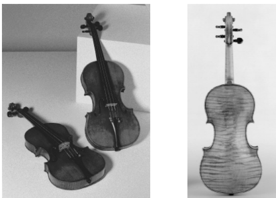
Figure 1: Left : Violin Tua (E.1932) and Davidoff (E.1111) from Musée de la musique; Right: Davidoff back.

Antonio Stradivari, Stradivarius says (1644-49-1737), is the most famous violin maker of all time. Surrounded by legends, the perfection of his instruments has fueled a mythology. Creative genius, it is nonetheless a craftsman thoughtful, methodical, heir to a prestigious tradition. Antonio Stradivari would have made about a thousand instruments which about six hundred and fifty have survived. The Musée de la musique in Paris maintains five violins, showing changes in his making process, a guitar and a pocket. In its collection, the museum keeps two violins which have the reputation to be “twins” called the Davidoff (E.1111) and the Tua (E. 1932) (figure 1). This reputation is based first of all on the year of facture. They were made in 1708 and this date has been confirmed thanks to dendrochronology [1-2]. This study has also shown that the wood used by Stradivari came from the same place and could come from the same supply. The second reason is the making process itself. The two violins would have the same dimensions (but they have not the same history and today the dimensions are nearly the same - \pm 1 mm for the back length-). The last reason, from the violin maker expert point of view is that the two backs are made of flat sawn maple. Today less than ten instruments from Stradivari are known to be made according this process.