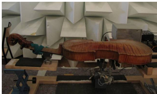
Figure 3 : Positioning of the violin for the back response measurement

soundboard [4]. The strings were muffled to not disturb the acoustic pressure field measured. For the same reason and to muffle the vibration of the back the violon was simply supported on a foam cradle (figure 2). To record the back response the violins were placed horizontally on three carved low-density open-cell foam blocks at the neck joint and the endblock (figure 3).