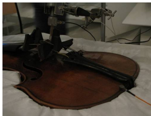
Figure 4 : muffling system, excitation and reference accelerometer

A point impulse excitation of the soundboard and of the back is provided by an automated hammer driven by an electromagnet that produces a reproducible shock (figure 4). The excitation point is the same for all instruments and is chosen on the bridge in the treble area as it is usually done for modal analysis of soundboards [7] for the soundboard and for the back responses.