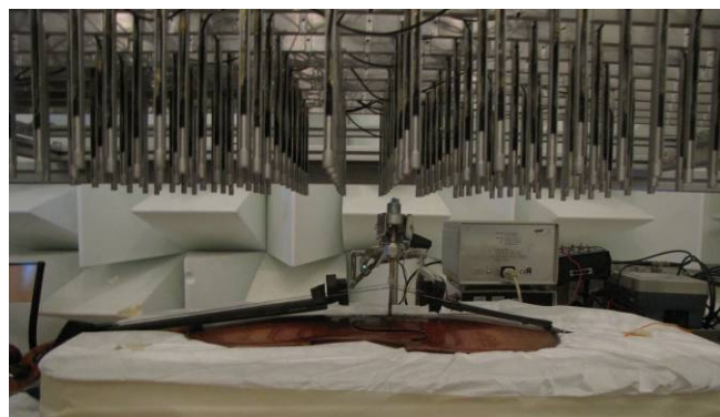
Figure 2 : experimental set up for the soundboard response

The experimental setup used for the three instruments (2 violins from Stradivari and a third one) was inspired by a precedent study on a Couchet harpsichord [3]. The impulse responses of the soundboards and the back are measured in the semi-anechoic room of the museum. Ambient temperature and hygrometry were controlled during the whole duration of the experiment and are the same as in the museum to avoid wood reaction due to hygrometry. The strings were chosen not to be removed for conservation reasons to avoid an additional stress cycle on the structures. The three violins are tuned at the same tension to avoid measuring a difference due to the pre-stress of the