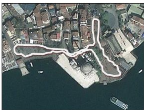
Ortaköy Pier Square