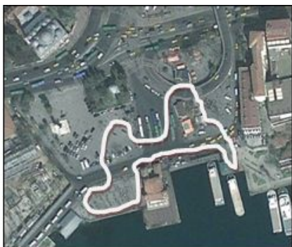
Beşiktaş Pier Square

Binaural recordings and measurements of overall sound levels are simultaneously obtained. In the walks which lasted approximately 15 min., the routes for soundwalks are determined in order to have a general opinion about the sound environments of the selected areas, by considering how citizens act in these areas in their daily life (Figure 2).