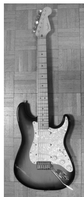
Figure 1: Fender Stratocaster

In 1949, bringing together certain experiments by stringed-