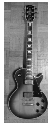
Figure 2: Gibson Les Paul

instrument makers on the solidbody guitar, Fender invented what is now considered to be the "mother" of this type of guitar: the Telecaster [6], which is still listed in the Fender catalog, remains more or less unchanged since 1950. In 1954, Fender created the "Queen of electric guitars", the Fender Stratocaster [7] (Figure 1). This solidbody guitar has outproduced all other guitars worldwide and is also the most copied. Since the 1950s the Fender catalog has added other electric models, completing the range, but these have not caused the stir or had the longevity of the two mythic models presented here.