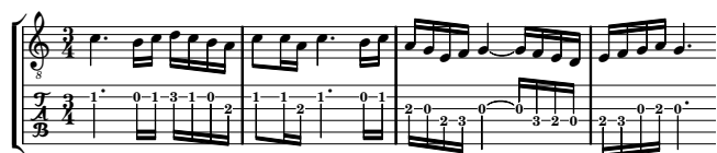
Figure 4: Score in staff notation (top) and its corresponding tablature notation (bottom)

Despite this imitation-like training, the electric guitarist