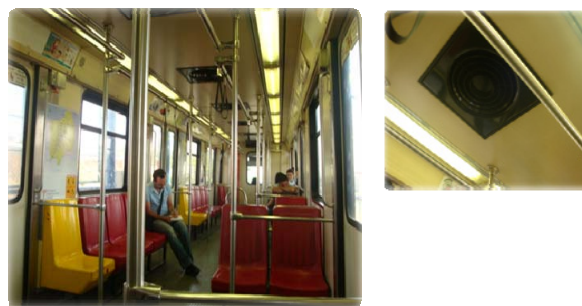
Figure 2: Air-conditioning event (tren ligero).

To have a trace of all noise events (sonoscenes), supposed to be perceptible by the participants during the