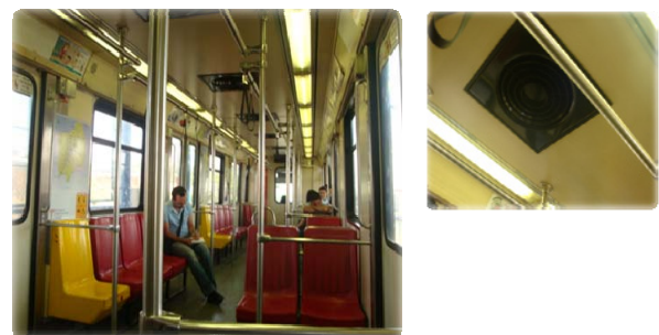
Figure 2: Air-conditioning event (tren ligero).

To have a trace of all noise events (sonoscenes), supposed to be perceptible by the participants during the