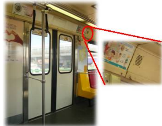
Figure 1: Tram bell during opening and closing doors (tren ligero).

The pictures (Figures 1 and 2) taken can place the sound sources in the environment of the subject. Indeed in a confined space as a train or train the sound field is rather diffuse what we recognize in the similarity of the two acoustic images (Figure 3). It was therefore difficult to locate the sources in the environment.