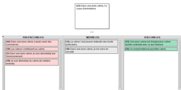
Figure 1: First step of Q-methodology.

In the first step, the participants have to classify each sentence in one of three columns: do not agree, neutral and agree, Figure 1. This step allows participants to read first all sentences and make a rough selection.