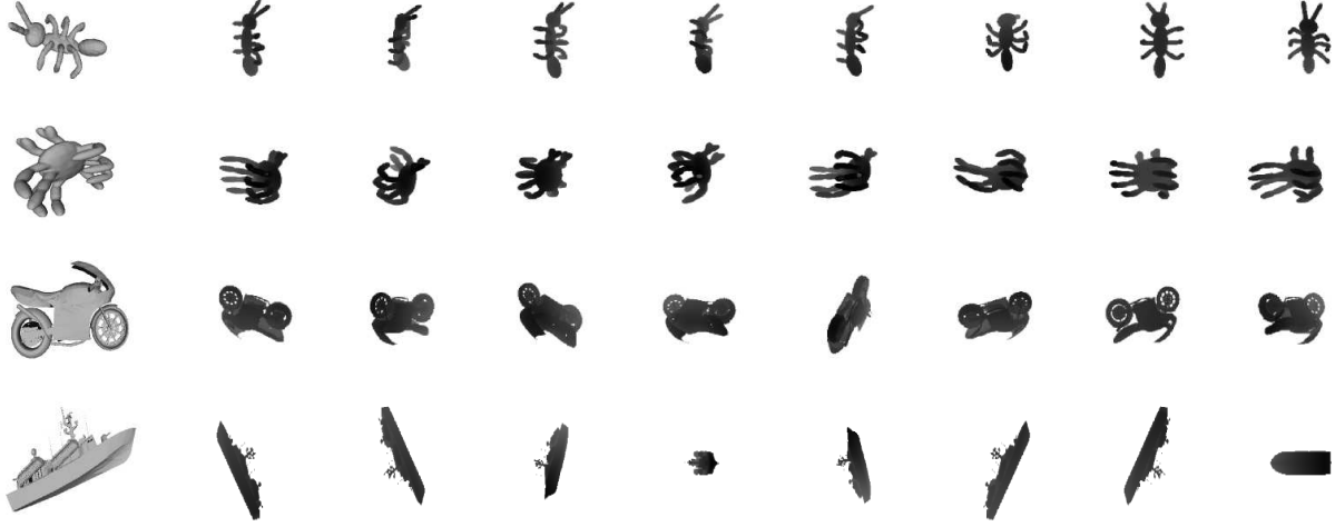
Figure 2: Example of 3D models from the McGill (models in the two first rows) and the Shrec12 (models in the two other rows) data-sets. The first column shows renderings of the models, while the other columns show depth images extracted randomly from the corresponding models.

analysis to build compact yet very discriminative shape signatures using a small dictionary size.