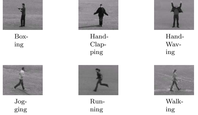
Figure 2: Example of videos from KTH

For experiments, we use VLAT indexing method to obtain signatures from SoPAF descriptors. We train a linear SVM for classification.