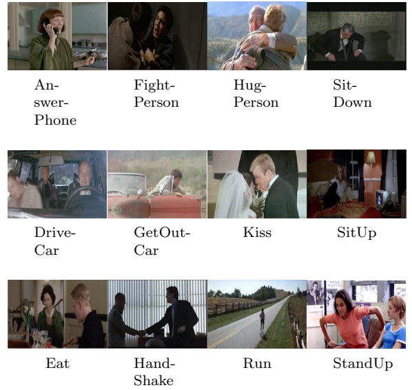
Figure 3: Example of videos from Hollywood2 dataset