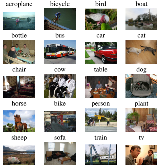
Fig. 1. Images from VOC 2007 database.

All our experiments are based on the same type of feature: SIFT descriptors computed on a dense grid. More precisely,