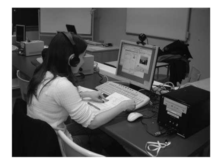
Fig. 2. A teacher trainee at work

chosen as the platform for social communication and a collective blog<sup>4</sup> was used to present two categories of participants (learners from UC Berkeley and teacher trainees from Lyon 2) as well as to store documents (pictures or weblinks to online videos) to be used for the creation of language learning tasks.