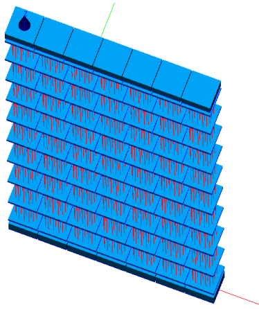
Figure 1: Finite element mesh of a row of fuel assemblies: Grids (blue) and guide tubes (red). The fuel rods are not plotted.

the relative transient displacements (for the convergence with respect to the number of global eigenvectors has been analysed) is plotted in Fig. 2.