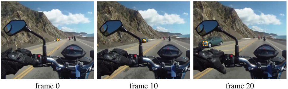
Figure 1: Example sequence with overlaid box showing the output of our specialized “forward” motion model, where the velocity and scale of objects approaching the camera tend to increase. Neither Brownian nor constant-velocity motion models are as successful at tracking interest points here.

It is too often that tracking algorithms lose track of interest points in image sequences. This persistent problem is difficult because the pixels around an interest point change in appearance or move in unpredictable ways. In this paper we explore how classifying videos into categories of camera motion improves the tracking of interest points, by selecting the right specialist motion model for each video. As a proof of concept, we enumerate a small set of simple categories of camera motion and implement their corresponding specialized motion models. We evaluate the strategy of predicting the most appropriate motion model for each test sequence. Within the framework of a standard Bayesian tracking formulation, we compare this strategy to two standard motion models. Our tests on challenging real-world sequences show a significant improvement in tracking robustness, achieved with different kinds of supervision at training time.